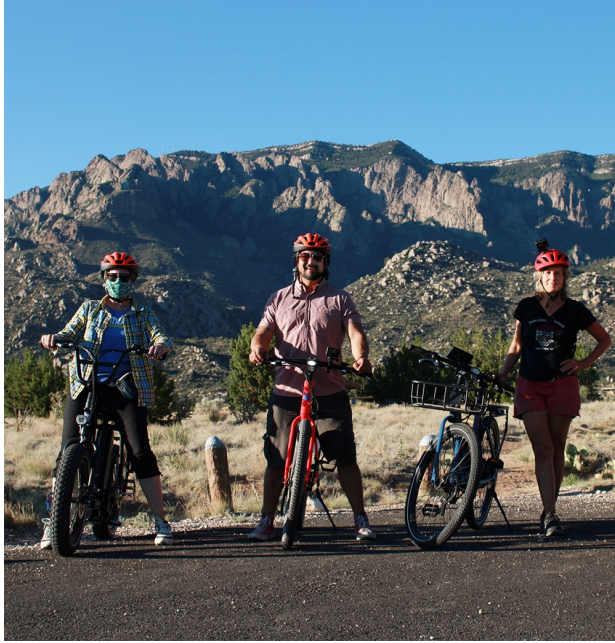
Free-to-Roam Ebiking lead team