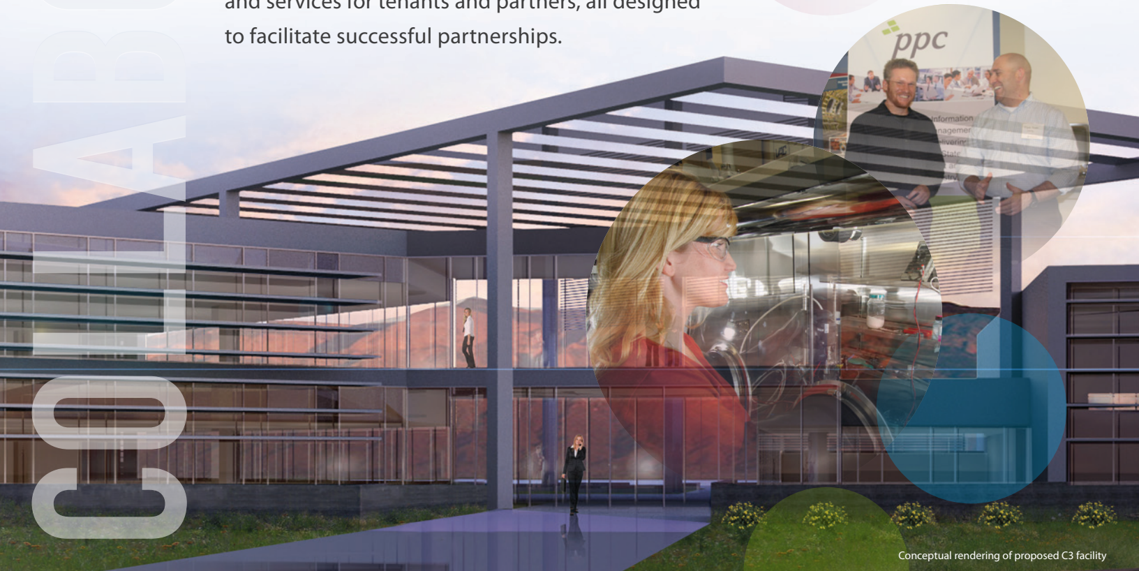
Conceptual rendering of proposed C3 facility