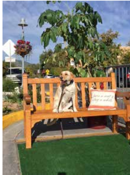
Park(ing) Day on Central Avenue