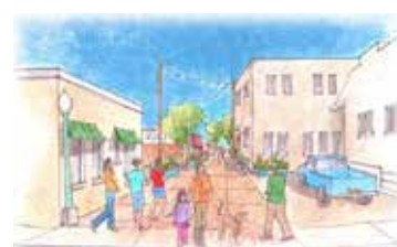
Alley Improvement Project