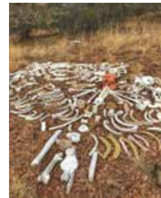
Clay art is central to Silver City ACD's efforts (l-r: Bowls for Hunger, Silver City Clay Festival, and One Million Bones installation)

Silver City Arts & Cultural District hired a new director in 2017 and initiated comprehensive organizational development activities including a strategic planning process that culminates in early 2018. The organization has identified key strategies and goals through this process: