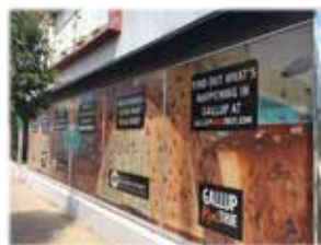
Vacant Building Window Wraps