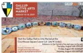
Native Arts Market Launched in August

The group, working with the City of Gallup and technical assistance provided by New Mexico MainStreet completed design work for improvements to the alleyway between the municipal government offices and the downtown district. They also installed window wraps on a number of downtown buildings aimed at promoting vacant properties for adaptive reuse by local arts and cultural enterprises.