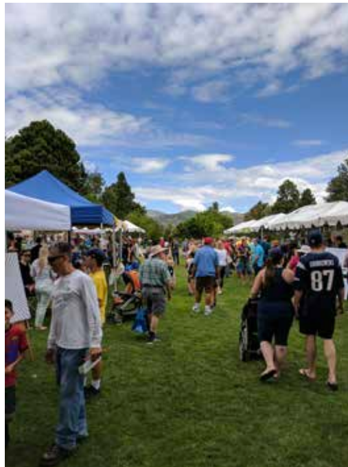
Los Alamos ScienceFest, with 15,000 attendees, was a significant economic support for area artists and art vendors