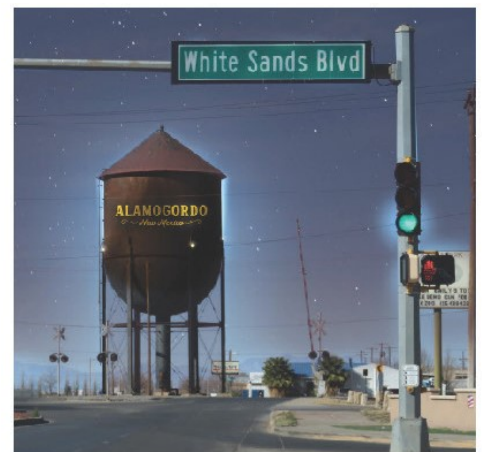
Photosimulation of the refurbished water tower landmark (with LED lighting) at the west end of 10th Street.

Alamogordo MainStreet will use the funds to create an informational and attractive public space within the existing Union Pacific-owned median property in the middle of 10th Street between Railroad Avenue and Eddy Drive. This project will pay tribute to Alamogordo’s railroad history through landscaping, minor tower maintenance, informational signage, MainStreet district wayfinding/walking map, and lighting.